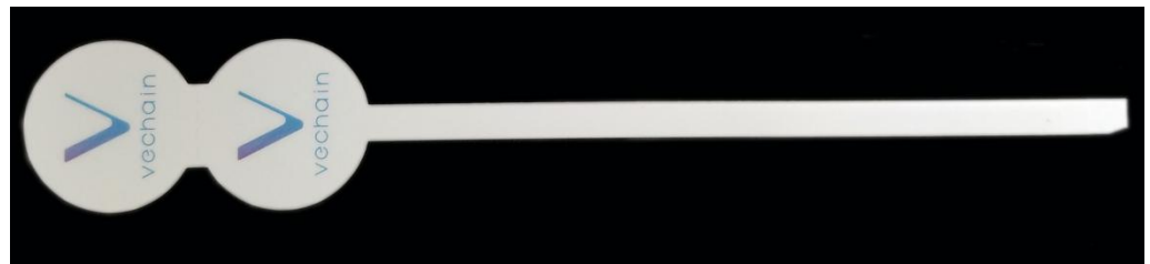
b. Product Pic