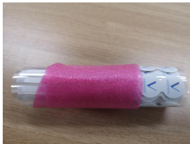
c. Package Pic